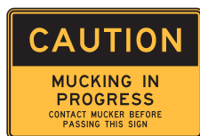
Part No. Material Dimensions 04663226 Mtl-C100 450 x 300