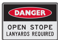
Part No. Material Dimensions 04181259 Mtl-C100 450 x 300