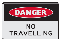
Part No. Material Dimensions 04181225 Mtl-C100 450 x 300