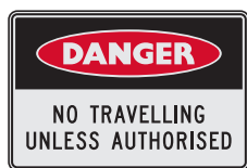
Part No. Material Dimensions 04181242 Mtl-C100 450 x 300