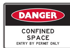
Part No. Material Dimensions 01322233 Mtl 450 x 300