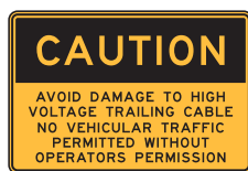
Part No. Material Dimensions 04663192 Mtl-C100 450 x 300