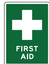
Part No. Material Dimensions 03774466 SAV 90 x 125