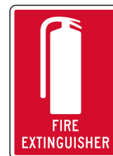
Part No. Material Dimensions 01523446 SAV 90 x 125