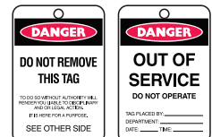
Part No. Material Dimensions 03044045 Poly Tag 100 x 150