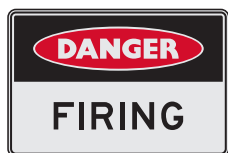
Part No. Material Dimensions 04181174 Mtl-C100 450 x 300