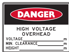
Part No. 0324 7722 Material 1.4 Poly Dimensions 600 x 450