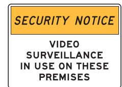
Part No. 0324 8521 Material 1.4 Poly Dimensions 600 x 450