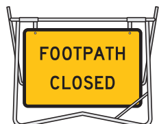
Part No. 0300 3738 Material SWST Dimensions 900 x 600