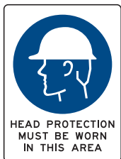
Part No. 0324 8334 Material 1.4 Poly Dimensions 450 x 600