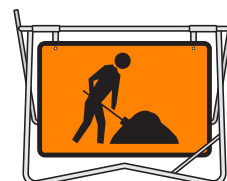
Part No. 0370 8183 Material SWST Dimensions 900 x 600