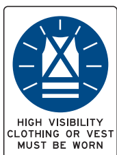
Part No. 0324 8385 Material 1.4 Poly Dimensions 450 x 600