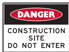
Part No. 0324 8062 Material 1.4 Poly Dimensions 600 x 450